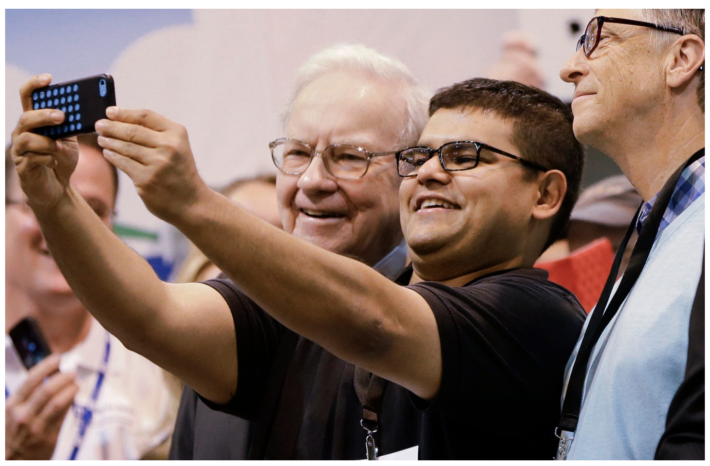
HOW TO LIVE, A Lecture